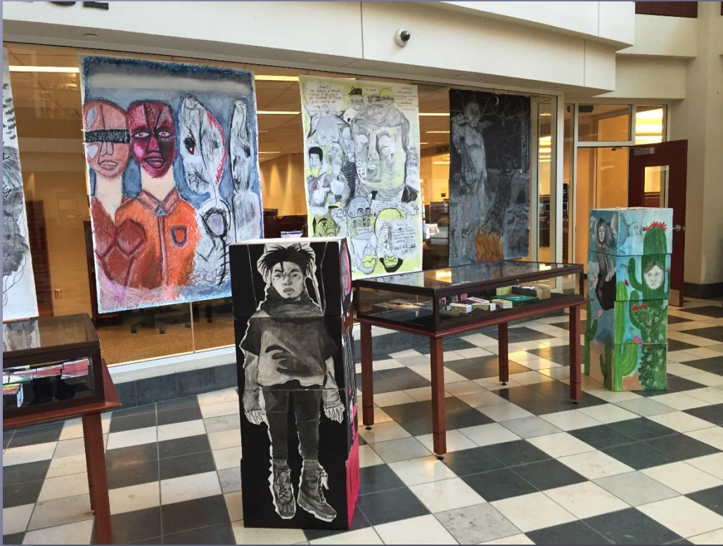
Environmental Puppets Student Art Exhibit April-May 2016

Using surprise or unexpected or unconventional techniques to bring the arts to our students.