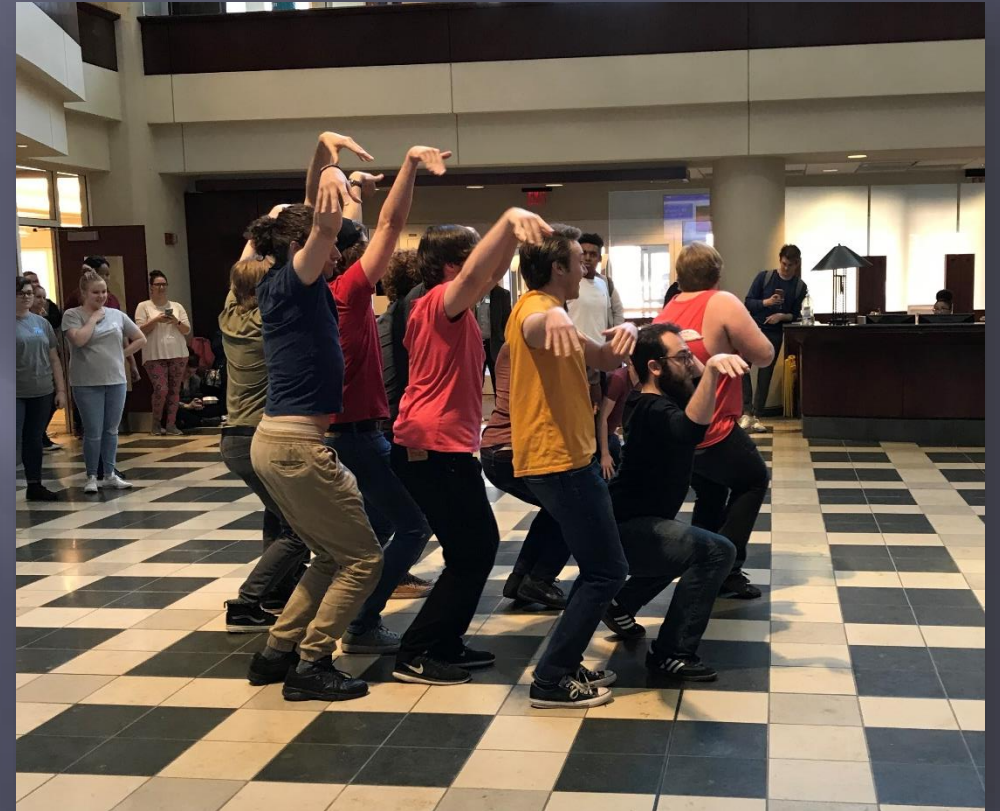
Joseph and the Amazing Technicolor Dreamcoat MTSU Theatre and Dance April 4, 2018