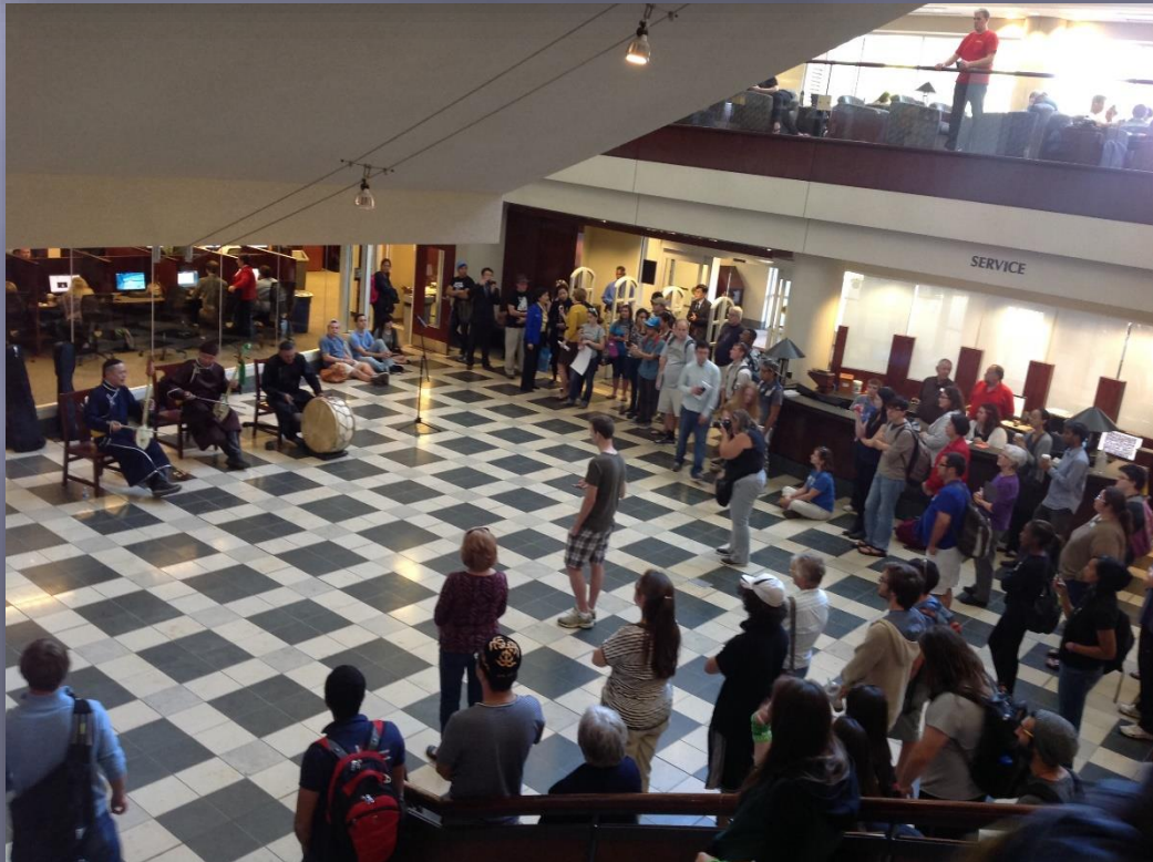
Alash Ensemble September 30, 2013