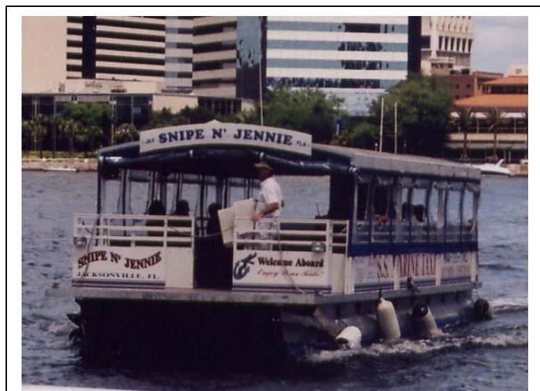
The water taxi crossing the St. Johns River