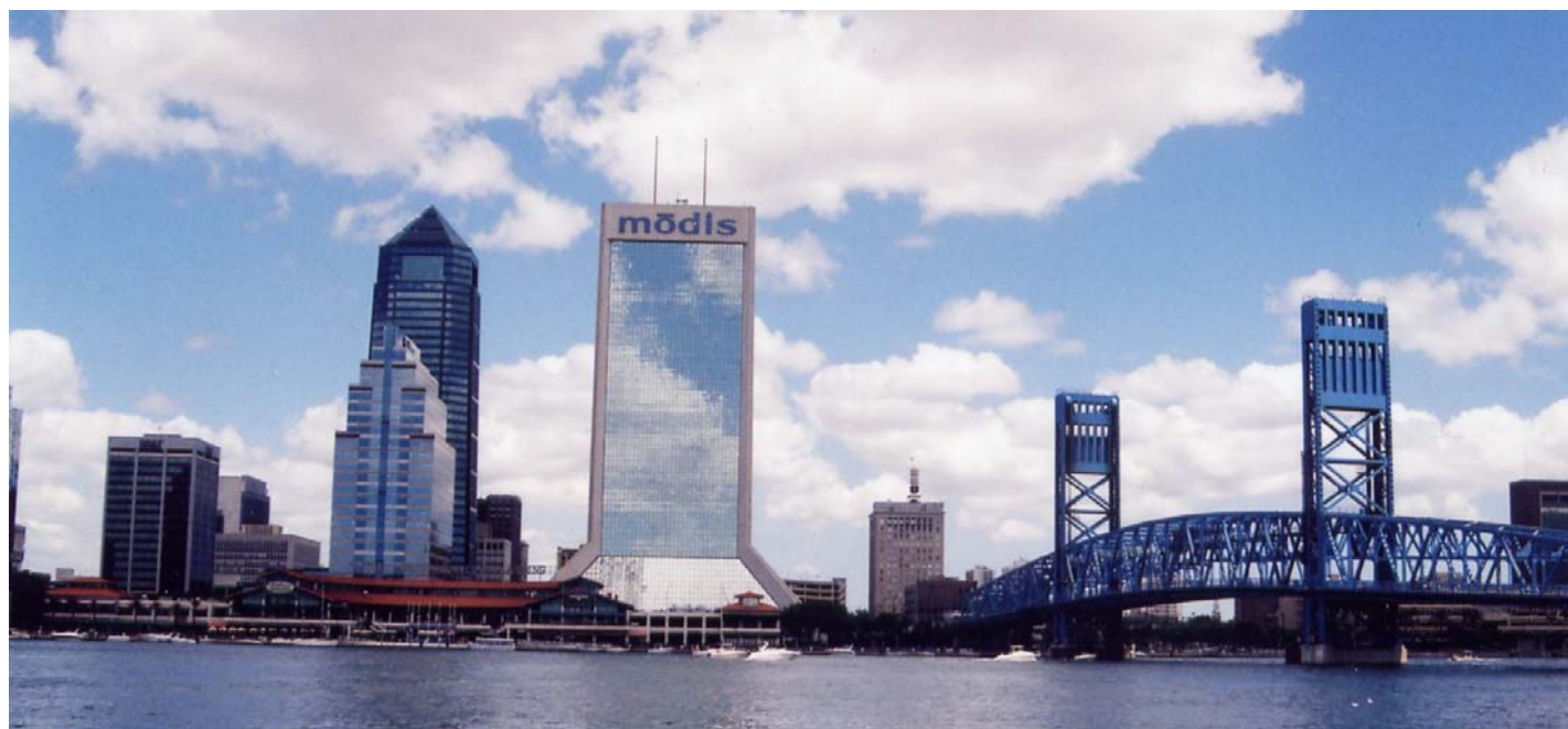
The riverfront in downtown Jacksonville

Once known as Cowford (the narrow spot in the river convenient for a cow crossing), Jacksonville, Florida, is now a bustling city located in the northeast corner of the state. The city is centered on the banks of the north-flowing St. Johns River and is bordered on the east by the Atlantic Ocean. The city is known for being the largest city in land area in the contiguous United States (only Sitka, Juneau and Anchorage, Alaska are larger), the home of Super Bowl XXXIX, and now SEMLA XXXVII!