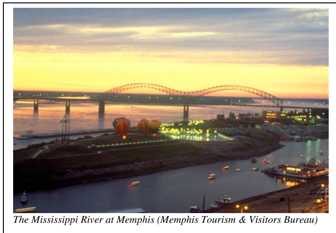
The Mississippi River at Memphis

We're excited about the sessions and other activities planned for the conference, and we look forward to sharing it all with as many SEMLA-ites as possible. Watch the conference Web site for further information about Memphis attractions and events plus travel directions.