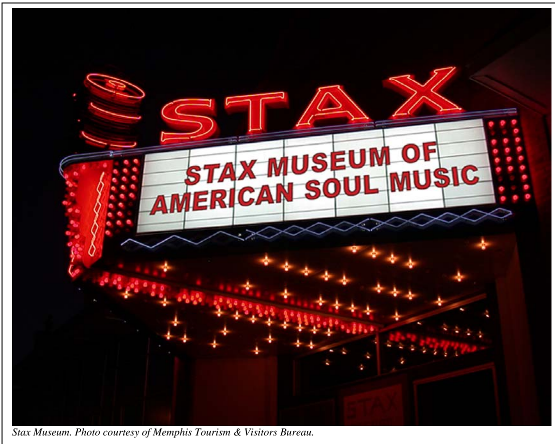
Stax Museum.