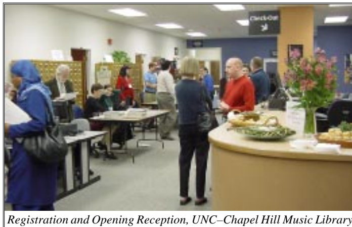
Registration and Opening Reception, UNC-Chapel Hill Music Library.