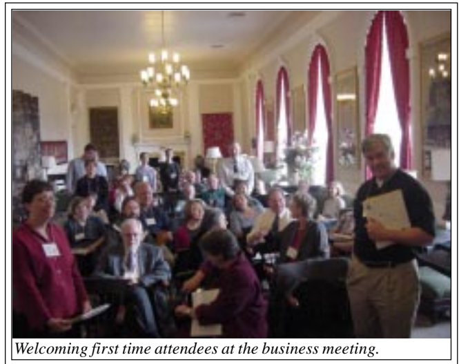
Welcoming first time attendees at the business meeting.

A delicious close to a delicious meeting was generously provided by Duke University in the form of lunch from Bullock's BBQ.