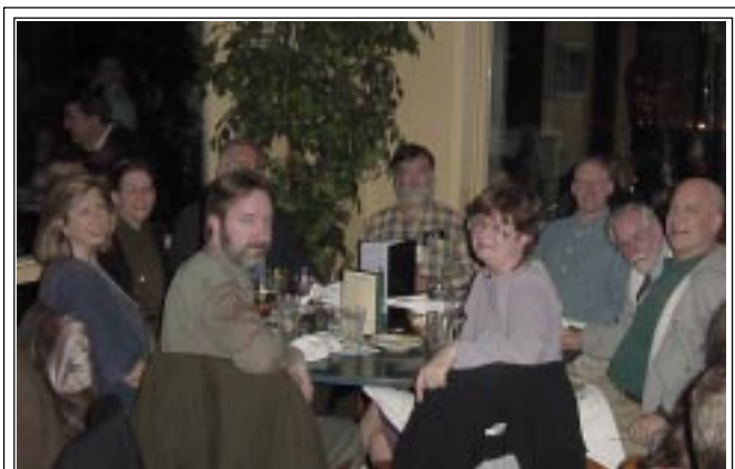
Enjoying food and camaraderie at the Hilltop Restaurant.