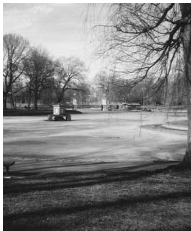
Boston Common, February, 1998