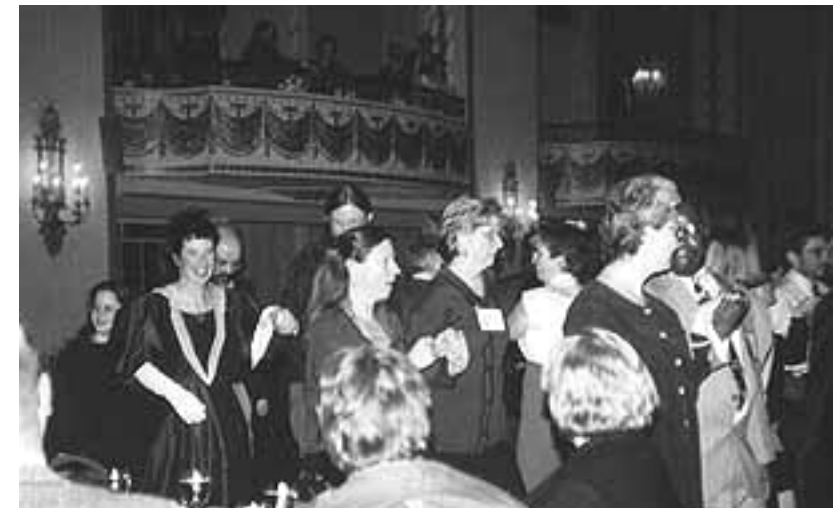
Dancing at the MLA Banquet, Boston, February 1998